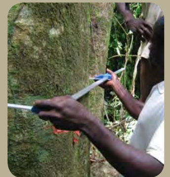
KNOWLEDGE OF THE RESOURCE FOREST INVENTORIES FIELD WORK