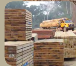
TIMBER PRODUCTS CHAIN OF CUSTODY & CERTIFICATION