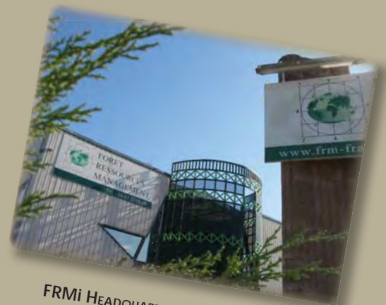
FRMi HEADQUARTERS - SOUTH OF FRANCE

T o promote a better approach for the safeguarding of tropical forests, our keywords are proximity, scientific rigueur, pragmatism, capacity building and dialogue.