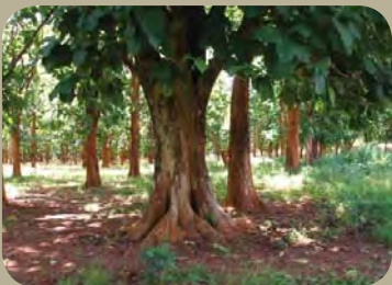
PLANTATIONS CREATION - MANAGEMENT PRODUCT VALORIZATION