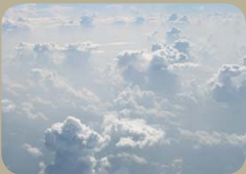
CLIMATE CHANGE REDD+ REDUCING EMISSIONS