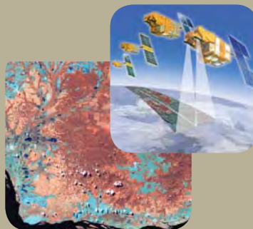
KNOWLEDGE OF THE MILIEU MAPPING - REMOTE SENSING GEOGRAPHIC INFORMATION SYSTEMS LAND MANAGEMENT