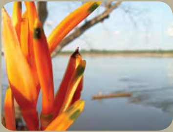
SUSTAINABLE MANAGEMENT PLANNING IN NATURAL TROPICAL MOIST FOREST