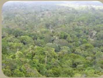
FOREST ENGINEERING IN TROPICAL MOIST FORESTS