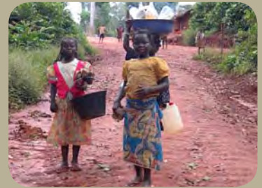
PRESERVATION OF THE RIGHTS AND LIVELIHOOD OF LOCAL POPULATIONS AGRICULTURE - RURAL DEVELOPMENT